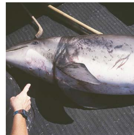
Hubbs Sea World

REMINDER: All commercial fisheries are required to report to NOAA Fisheries all incidental injuries or mortalities of marine mammals caused during the course of fishing activities. Call NOAA Fisheries at (727) 824-5312 for reporting forms or further information.