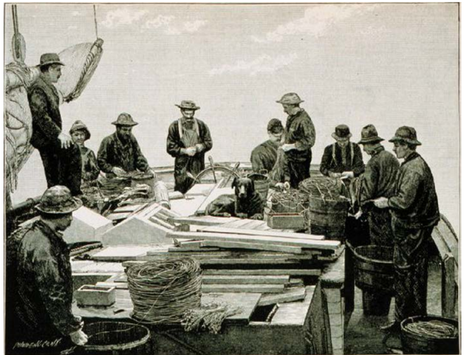
THE HADDOCK FISHERY.

Fixing trawls on deck of Gloucester haddock schooner Mynic. (Brit. v. vol. 4, p. 207.)